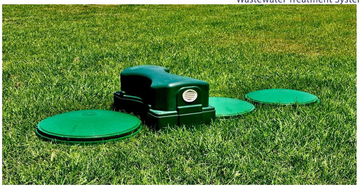
2.5 mtr x .7 mtr foot print after installation.

The ACE 1200 receives and treats the wastewater from the whole household. Toilets, bathrooms, laundry and kitchen. Advanced treated effluent is achieved by the whole process, including anaerobic and aerobic treatment. Microbes digest the waste throughout the three chambers, nitrogen is dramatically reduced by recirculation and consumption. Pathogens are removed (when required) by disinfection after the airlifting of the effluent from the clarification chamber. For best results, the influent should be free of any harmful products that will kill off the microbes.